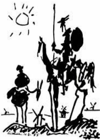
Picasso Don Quixote 1955 sketch

After carefully examining all this evidence and meeting particular characteristics, the next step will be to compare DNA similarities with his sister, a very complex step. His sister, Luisa de Cervantes died in 1623 and is buried in a convent in Alcala de Henares, 19 miles east of Madrid. If this does not prove to be the place Cervantes was buried there are four other possibilities within the convent. In Cervantes' day, graves were not marked with long lasting memorials such as headstones. Stay tuned. It is very interesting that as we are doing our DNA to help us prove our family lines, 500 years after Cervantes' death, experts are also relying on DNA to prove the burial location of one of the best known Spaniards in Spain's History.